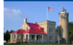
Mackinac Point Lighthouse