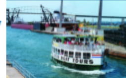
Soo Locks Cruise in Sault Sainte Marie