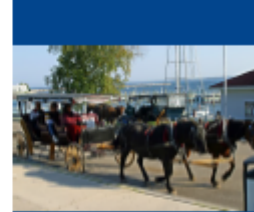
Tour Mackinac Island by Horse and Carriage