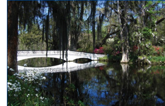
Take in the Picturesque Views of Charleston

Day 7: Enjoy a Continental Breakfast before departing for home... a perfect time to chat with your friends about all the fun things you've done, the great sights you've seen and where your next group trip will take you!