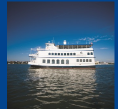
Cruise Around Charleston Harbor