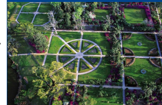
Visit Middleton Place and Gardens